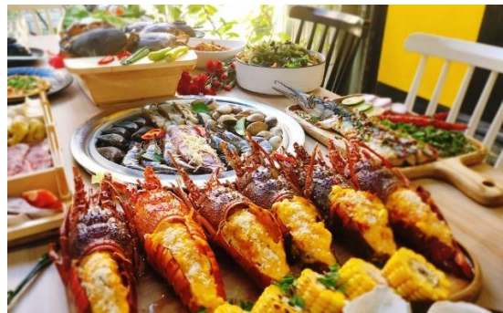
1/2 lobster per person