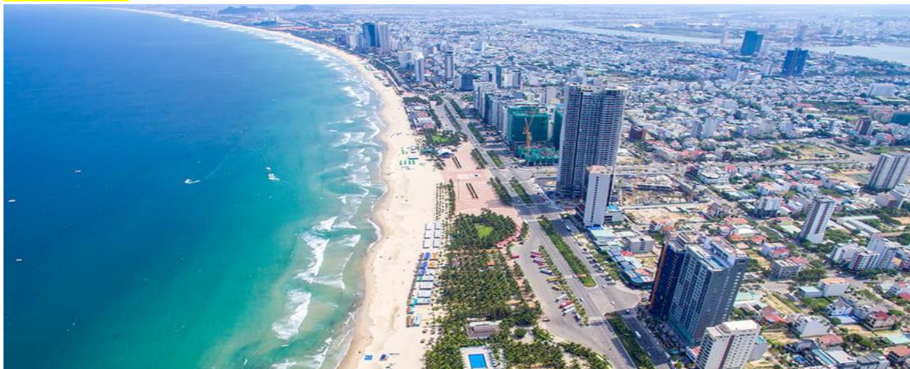
My Khe Beach - Danang