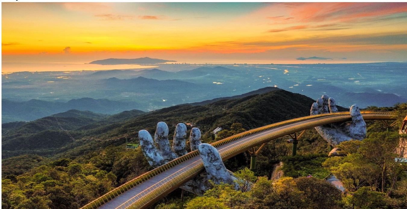
Golden Bridge in Bana Hills

In the morning, transfer to Bana Hills Station. You have a chance to ride on a modern system of cable cars helps you get a bird's-eye view, very miraculous and attractive while enjoying a feeling of flying in the blue sky amidst the clouds and wind. You will visit some old French villas en route, as well as the suspension bridge, Nui Chua & the Mountain Peak (at the height of 1,487m). Visit Linh Ung Pagoda, Golden Bridge, Sakyamuni Buddha's monument and Ba Na .