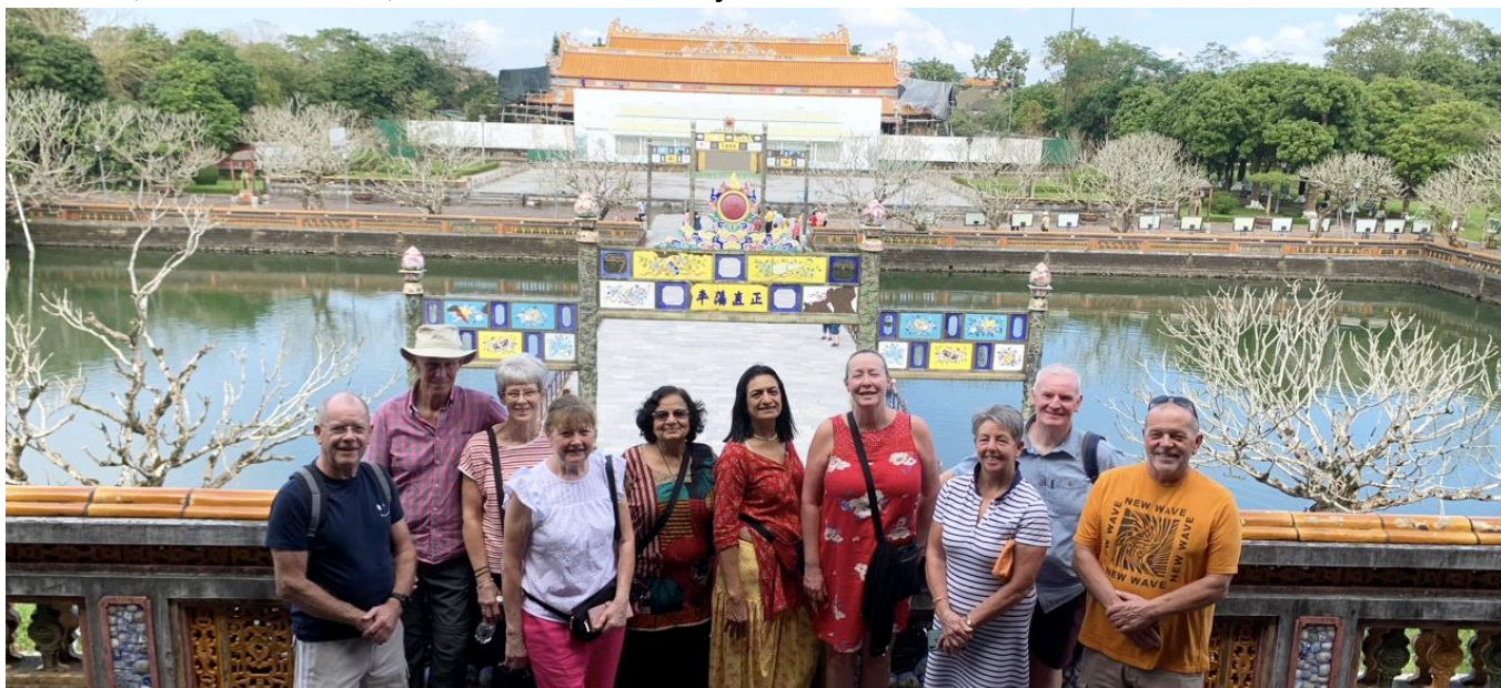
Hue Imperial Citadel

Have breakfast at hotel then take visit Imperial Citadel - built on 1804 and recognized by UNESCO as World's Culture Heritage, Continues to visit Flag Tower, Noon Gate, Nine Dymastic Urns, Nine Holy Cannons, Thai Hoa Palace, Forbidden Purple City.