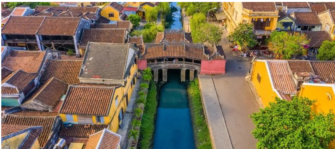
Hoian Ancient Town

Then transfer to Hoian ancient town to visit Family Chapel built by prominent, merchant or official families as the center ancestor worship a Chinese style Pagoda or Assembly Hall: Japanese Covered Bridge Pagoda which is the first bridge on this site and was constructed in 1593 by Japanese community of Hoi An to link the Town with the Chinese Quarter across the stream, besides looking at Fukien Association temple, Ceramic Museum and Chua Ong Temple