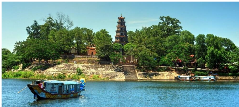
Dragon boat on Huong River with Thien Mu Pagoda

Have dinner at local restaurant. Your special menu today include 1/2 lobster per person